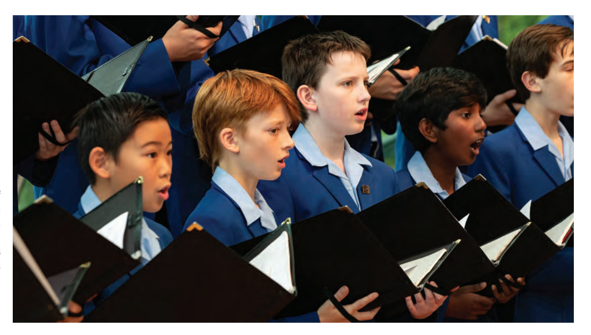
Members of The Australian Boys Choir in rehearsal, March 2023

It's yet another example of music shared in community bringing people together to create unforgettable experiences and magical memories.